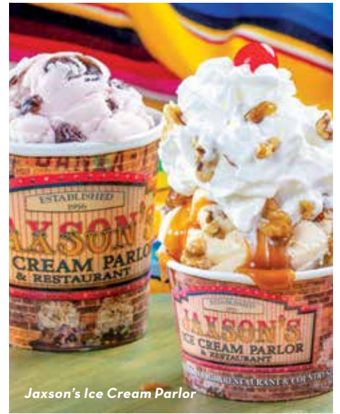
Jaxson's Ice Cream Parlor

Food halls have taken the USA by storm and Greater Fort Lauderdale isn't left out. Hip Sistrunk Marketplace has become a favored local hangout – swing by for make-your-own poke bowls, pita wraps, craft tacos, ceviche and classic Southern dishes. There are regular live music sets and art shows here too. Meanwhile, die-hard foodies shouldn't miss the annual Visit Lauderdale Food & Wine Festival , which takes place in January. The event showcases offerings from some of Greater Fort Lauderdale's finest and most creative restaurants and allows punters to try a variety of tipples too.