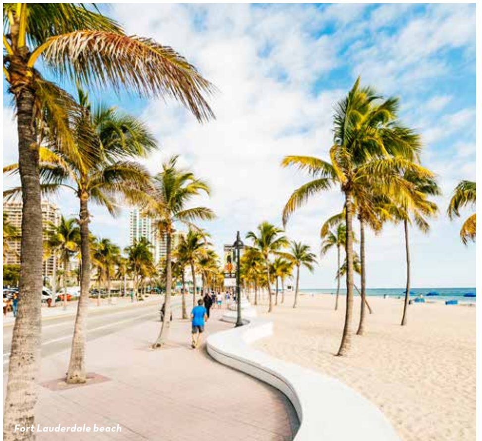
Fort Lauderdale beach

Craving a change of pace? Strike south to Dania Beach , whose pristine sands are gloriously quiet, and studded with pastel lifeguard towers and palms. The Dania Beach Fishing Pier is a dreamy place to watch the sunrise too.