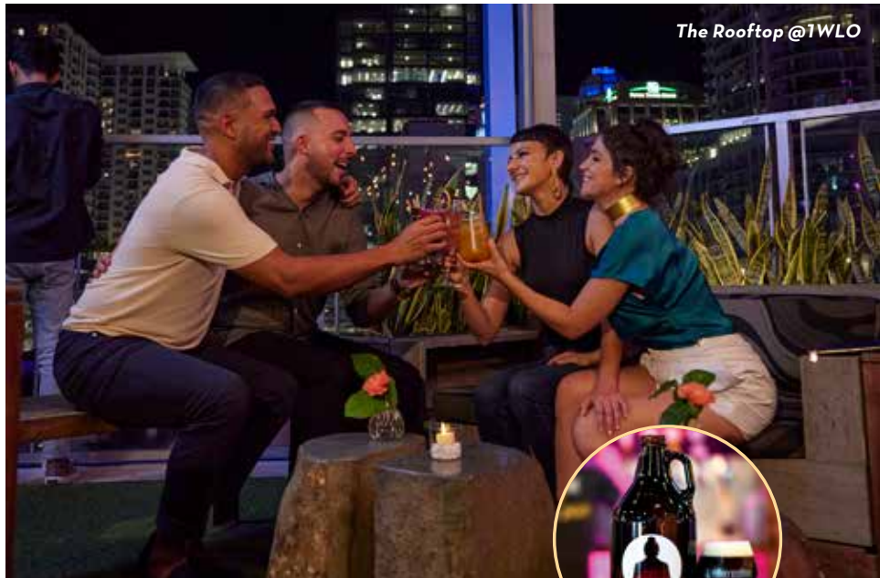
The Rooftop @1WLO

It's not 'lights out' in Fort Lauderdale when the sun sets. A variety of luxurious cocktail lounges, waterside bars and down-to-earth joints showing sports keep the city alive when evening falls. The Rooftop @1WLO , on Las Olas Boulevard, makes a lovely special occasion spot. Visit for epic views of the winking skyline, imaginative cocktails and elevated bar bites. Speakeasy Unit B is another noteworthy option. For date night, opt for No Man's Land , a romantic 1920s-style cocktail parlor that offers tempting sharing plates too. Wine connoisseurs should try out Vinos on Las Olas . This Key West export fits right in in Fort Lauderdale and offers world wines in a stylish space with cool vintage accents.