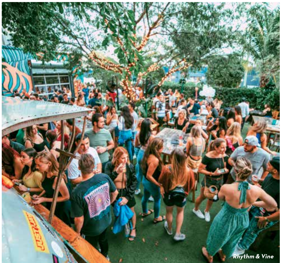
Rhythm & Vine

Fort Lauderdale sounds as good as it looks. Let smooth jazz and blues wash over you at Blue Jean Blues , a snug, low-lit spot for live music and a cocktail or two - or head to craft beer spot Funky Buddha for a low-key dinner, small-batch brews and some great local bands and vinyl DJ sets. Serious music fans should time their trip for the annual Tortuga Music Festival , which takes place in the spring. The event sees big names from across genres take to Fort Lauderdale's sands - come by to hear superstars like Wiz Khalifa or country greats like Shania Twain and Kenny Chesney. You'll catch musical giants performing at Hollywood's Hard Rock Live venue too.